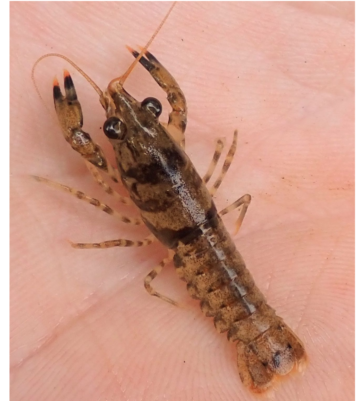
Hardin crayfish, new species