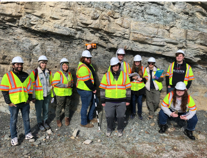
November, 2021: Students learn to use a hand-held gamma ray spectrometer on outcrops of the Mississippian Fort Payne Formation, Celina, Tennessee.