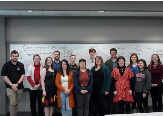
April, 2022: Students celebrate induction into the Theta Omega Chapter of Sigma Gamma Epsilon, the Earth Sciences Honor Society established in 1918.