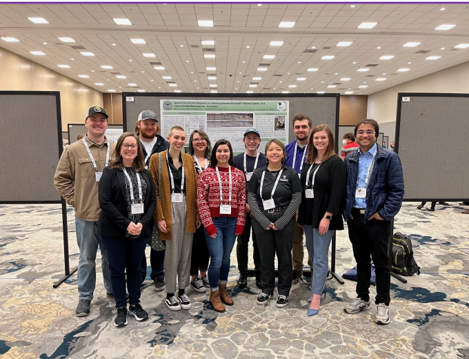
March, 2022: Earth Science students and faculty at the 2022 Southeastern Section Geological Society of America Meeting in Cincinnati, Ohio.