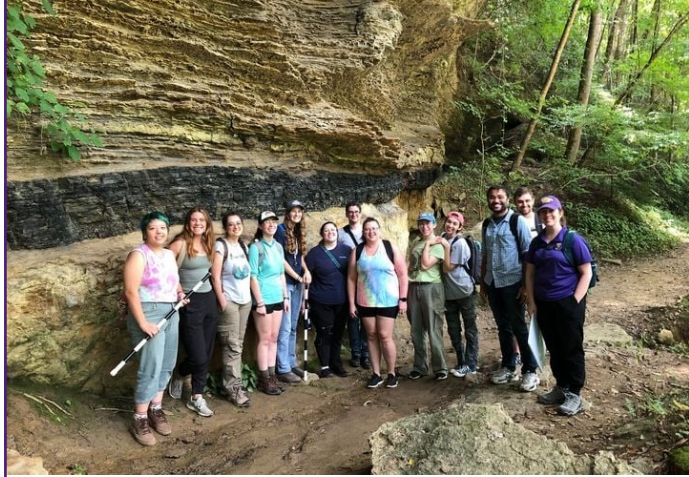
October, 2021: Sedimentation/stratigraphy and paleoclimate students measure a section of sandstone and coal on the Angel Falls Trail, Big South Fork, Tennessee.