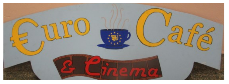
Movie nights with French, German or Spanish films were shown in the Euro Café in the past. This is the original sign that students made and hung over the door of the Café.