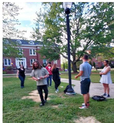
French club Avant-Garde playing pétanque, a French boule game, on the Quad during Lawn Game Day.