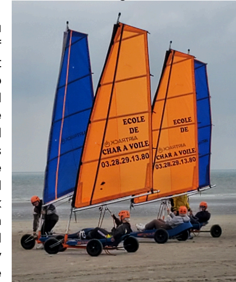
Student sand yachting on the beach of Dunkirk, France.

discovered French farmer markets, French cafés and restaurants, and the French way of life. They also learned about WWII and learned how to sand yacht! They visited museums and other cities around such as Bergues and Lille in France, and Ghent in Belgium.