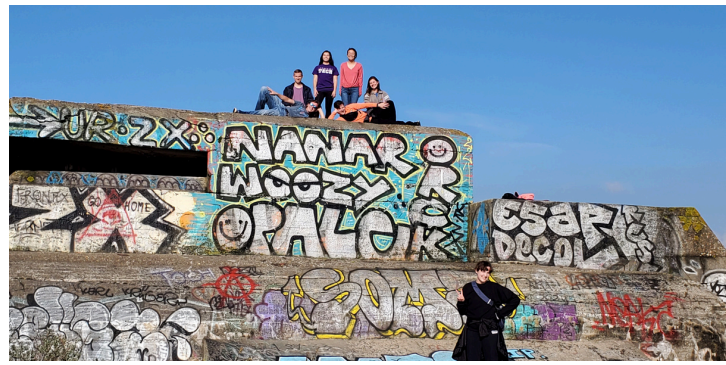
Students posing with a German WWII bunker in Dunkirk.