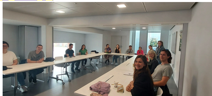
Students in Dunkirk, France, learning about French culture (FREN2050) during a study abroad in May 2024.