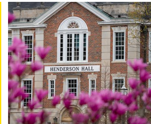
Henderson Hall, new home to the Department of Foreign Languages

Recently, we streamlined the concentration requirements for majors. Our degrees now start at the 1020 level, and we have removed one upper-level course from the program of study. This adjustment allows students to engage with their academic interests, making it easier to balance a dual-degree path. We are committed to supporting our students' goals by continually adapting our programs to meet their needs in today's dynamic academic environment.