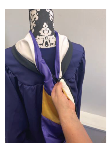
Next, adjust your hood as shown below.