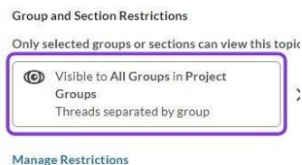
Figure: Once you have added the restrictions, they will display under Group and Section Restrictions.