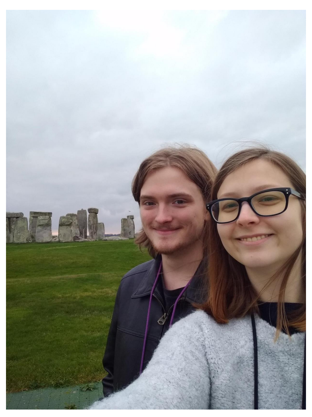
Us in front of Stonehenge