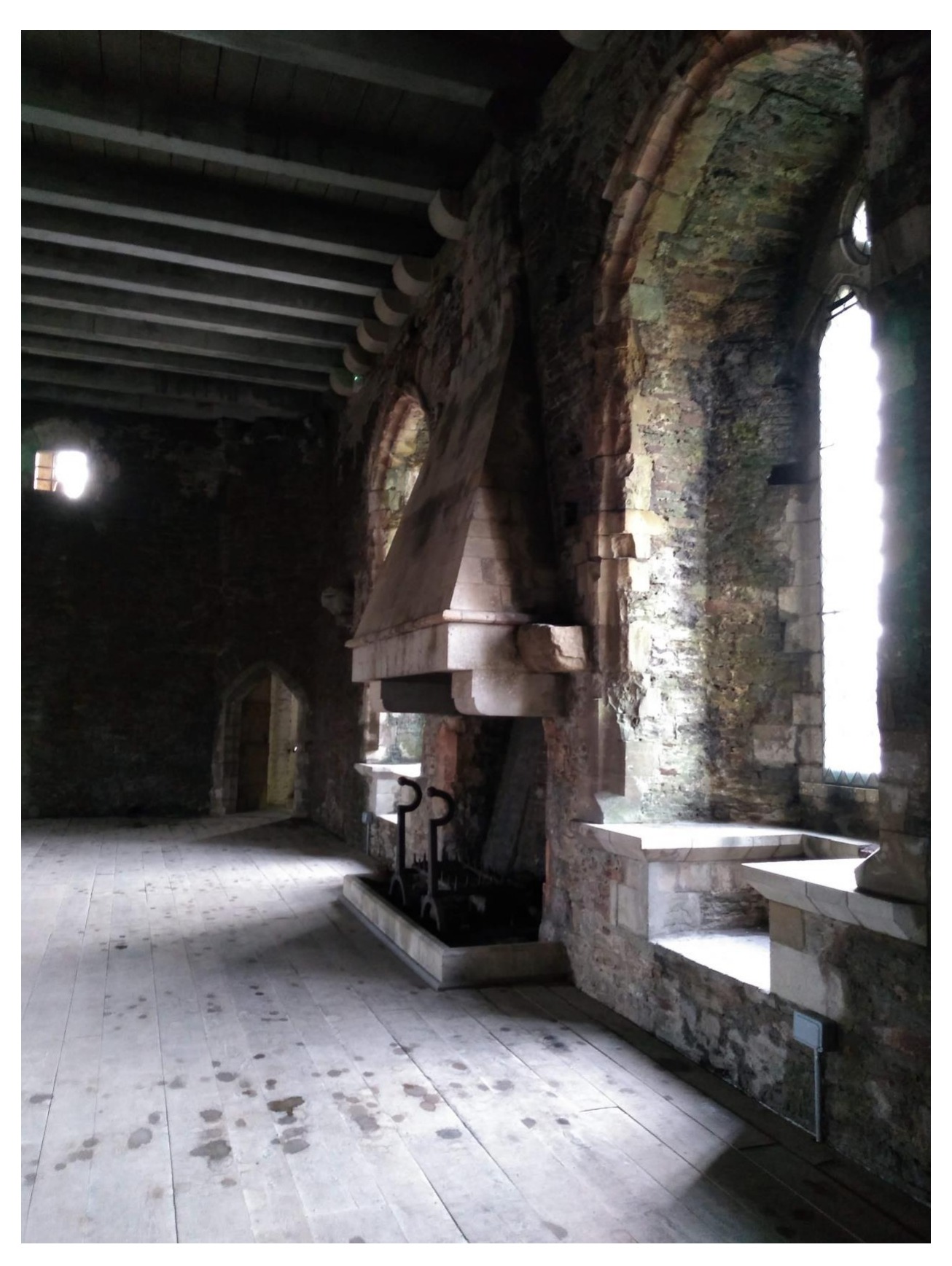
A fireplace in Caerphilly Castle